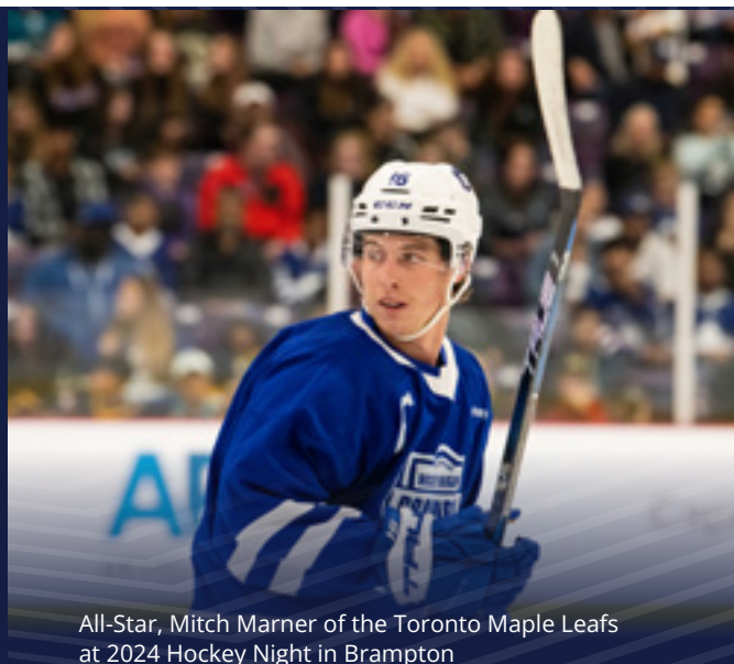
All-Star, Mitch Marner of the Toronto Maple Leafs at 2024 Hockey Night in Brampton