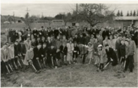
Peel Memorial Hospital, circa 1924 groundbreaking ceremony